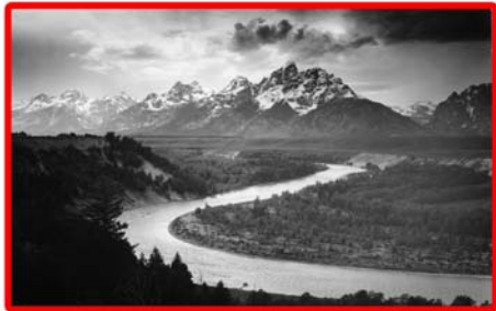
ANSEL ADAMS "TETON RANGE"

MANY ARTISTS IN THIS EXHIBIT WERE INSPIRED BY THE RIVER'S BEAUTY. MAKE SURE YOU ALSO CHECK OUT ANSEL ADAMS: CELEBRATION OF GENIUS IN THE GALLERIES. ADAMS' PHOTOGRAPHS WERE INSPIRED BY HIS LOVE OF THE LANDSCAPE.